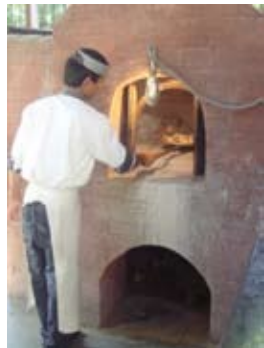
Authentic wood fired oven